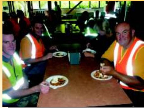
Canning Vale staff enjoying their delicious pancakes